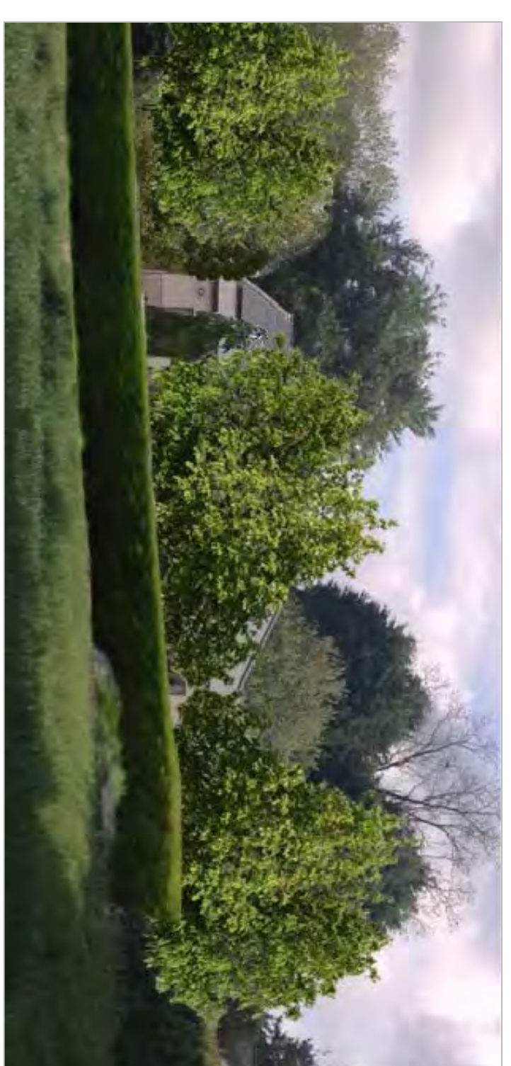
View of proposed planting from south