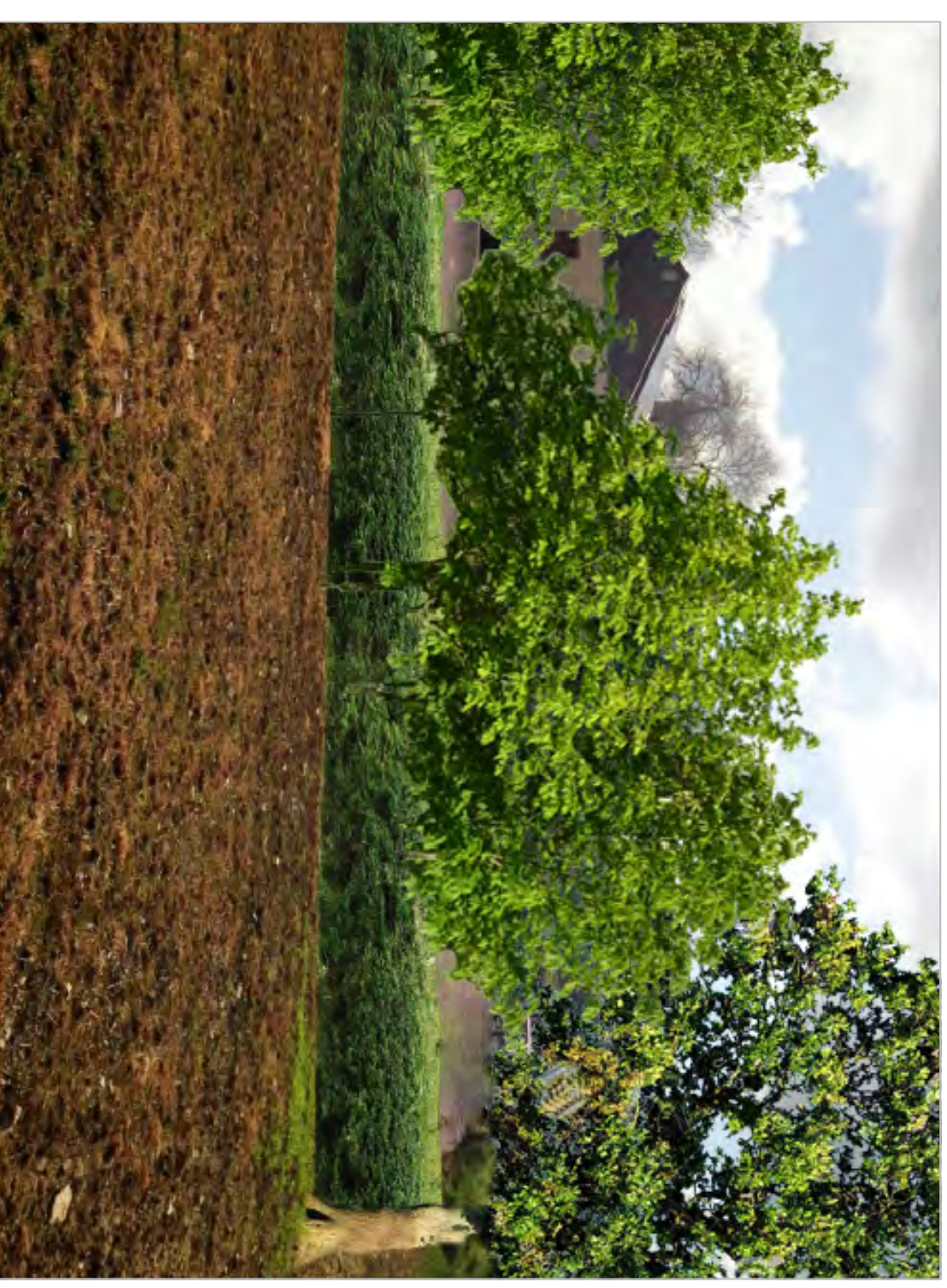
View of proposed planting from West